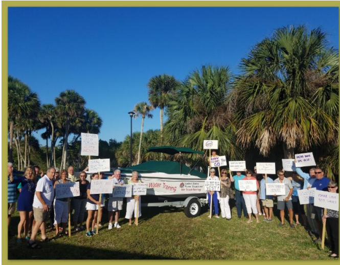
Safe Boating -Squadron Building