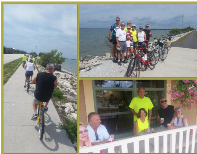
7 if by land 2 if by sea